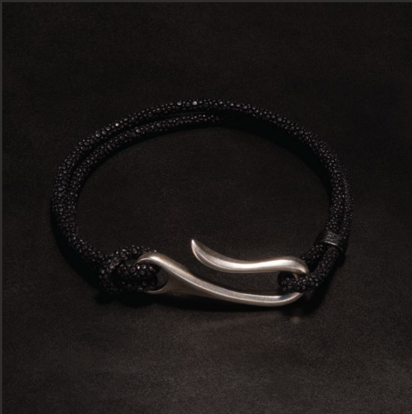
Bracelet Crochet in White Rhodium Plated Sterling Silver or Brass and Deep Dyed Galuchat "Noir" 3mm Cord.