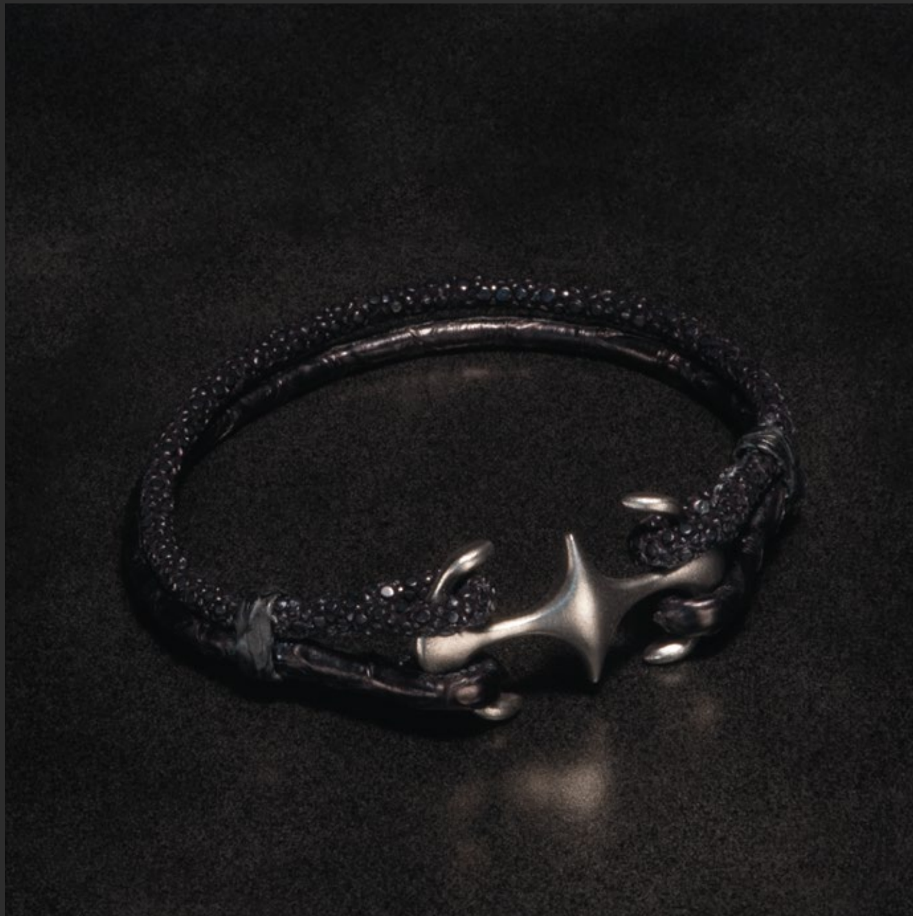
Bracelet Double-Ancre "Cords" in White Rhodium Plated Sterling Silver or Brass, Deep Dyed Galuchat "Noir" and black Python cords.